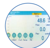
7" TFT LCD screen

Emergency Department Orthopaedics Department