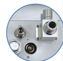
Stainless steel material